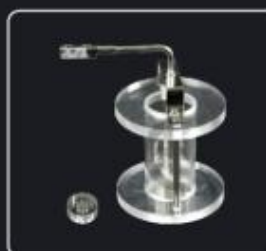
Bolus basket with 1 tube and guided disc