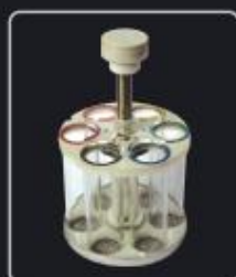
Magnetic basket (SAPO)