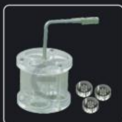
Bolus basket with 3 tubes and guided discs