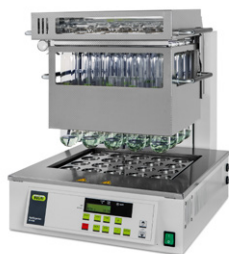
KjelDigester K-446 / K-449 Block digestion