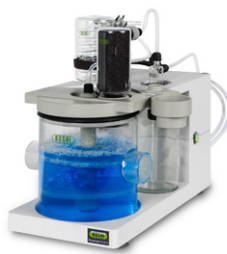
Scrubber K-415 Neutralization