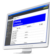
KjelLink PC software Data management