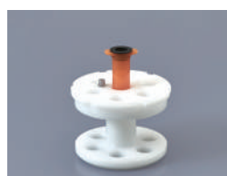
250AD-5S For 5ml syringe