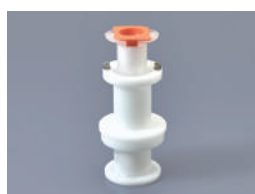
100AD-30S For 20/30ml syringe