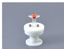
100AD-3S For 3ml syringe