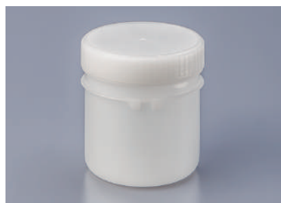
300 ml container

● Disposable cups and plastic containers.