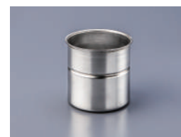
300 ml SUS 300 ml SUS container