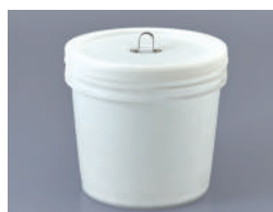
4000 ml container