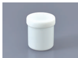
150 ml container