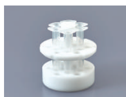
250AD-M3S×6 For Musashi syringe 3ml□6

* The syringes/barrels shown in the pictures above are not included.