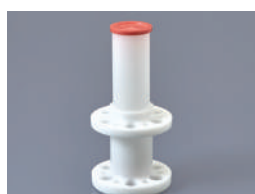
500AD-170B For 170ml barrel