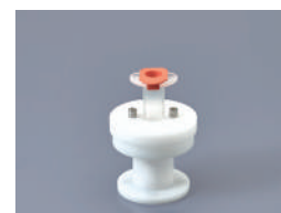
100AD-5S For 5ml syringe