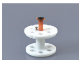
250AD-3S For 3ml syringe