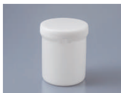
360 ml container [Type K] With keyways

* 160 ml anti-UV container is also available.