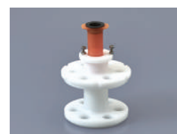
250AD-10S For 10ml syringe