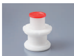
250AD-100BS For 100ml barrel