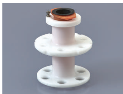
250AD-30S For 20/30ml syringe

● We provide various adapters for syringes and barrels. Contact us for items not listed.