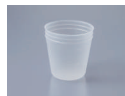
200 ml disposable cup