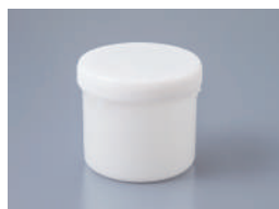
250 ml container