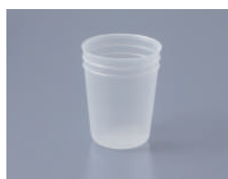
100 ml disposable cup