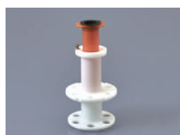
250AD-50S For 50ml syringe