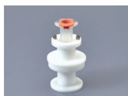
100AD-10S For 10ml syringe