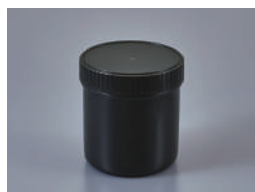
300 ml anti-UV container

* 160 ml anti-UV container is also available.