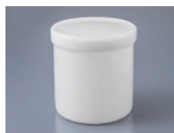
1000 ml container