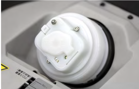
The picture taken with ARV-310P